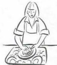
wash the dishes