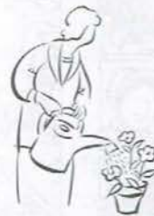
water the plants