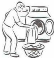
do the laundry