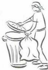
take out the garbage