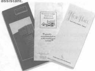
Some friends gave me some information about good hotels.

I want some apples, some wine, some potatoes and two oranges.