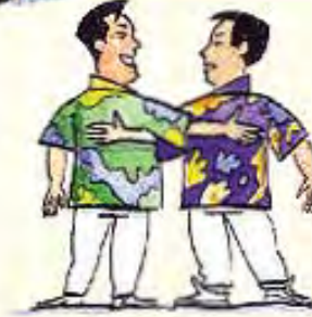
a pat on the back

Source: Brigham Young University, Center for International Studies