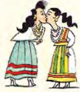
a kiss on the cheek