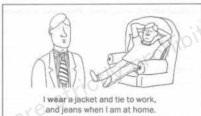
I wear a jacket and tie to work, and jeans when I am at home.