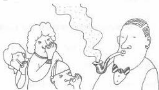
My father sometimes smokes a pipe. It smells awful!