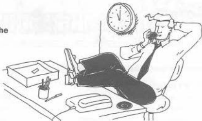
He stops and has a cup of coffee at eleven o'clock.