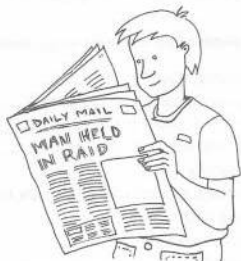
I read the newspaper every day.