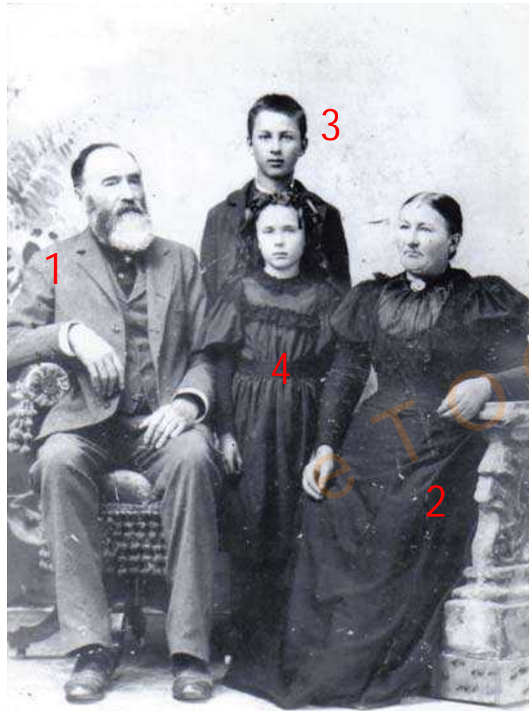
The Frost Family