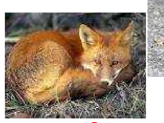
2. a fox