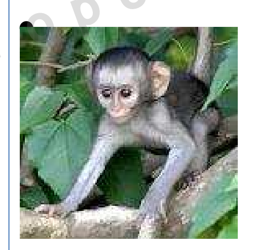
1. a monkey