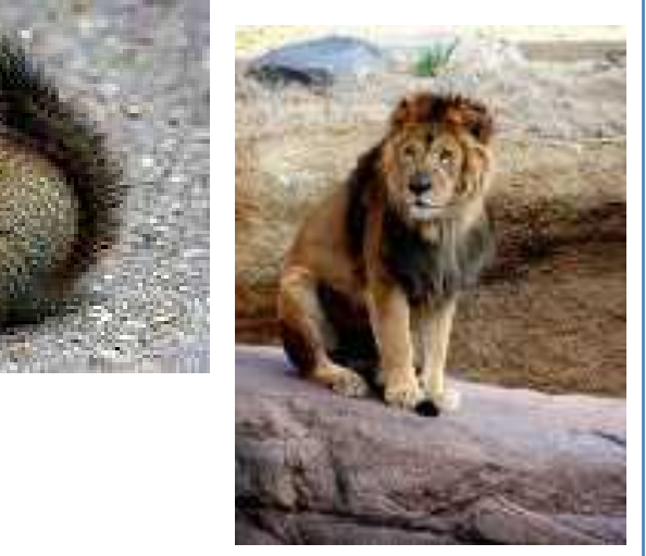
4. a lion