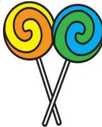
lollipops ペロペロキャン デー