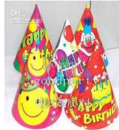
party hats パーティーの ぼうし