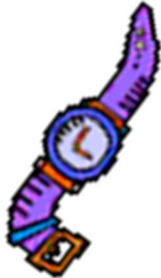
2. a watch