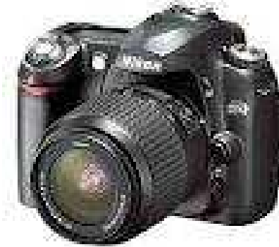
4. a camera