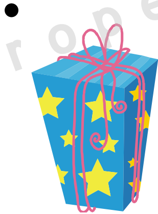
1. a box