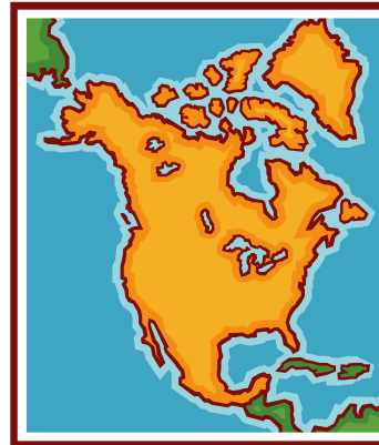
3. a map