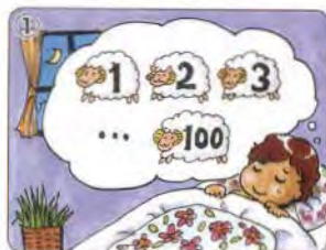
one hundred sheep